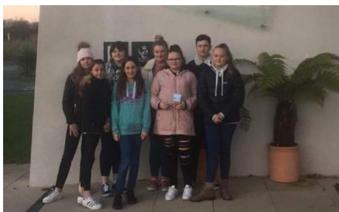
Llangoed Young Farmers at Halen Môn, Brynsiencyn

We had a cracking Christmas meal/party in the Liverpool Arms, Beaumaris, to end the year Llangoed Young Farmers also said goodbye to the Llanddona Village Hall. We've had a great time there over the years and we are very grateful to the Committee for its use. We are lucky enough to be able to carry on with Young Farmers in the Maes Gwyn hall in Llanddona.