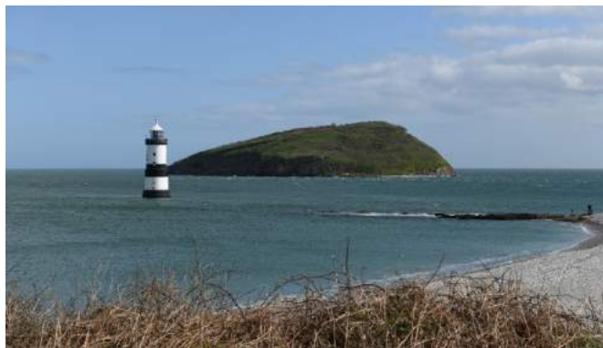
A stony beach, perhaps, but what a beautiful spot, no matter what the weather! Puffin Island and the lighthouse from the breach at Trwyn Du/Black Point, Penmon; the lighthouse has been unmanned since 1922, and was converted to solar power in 1996 (A Perrott)