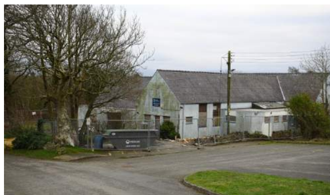
31 December 2018: roll on 2019! Llanddona's new Village Hall in the making; see page 2 for an update (A Perrott)