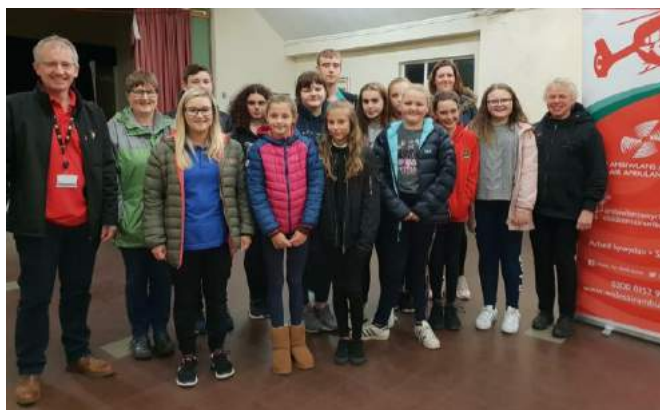
Llangoed Young Farmers and members of the Wales Air Ambulance Team