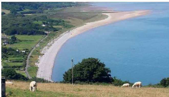
Llanddona beach from the heights above it, looking in the direction of Red Wharf Bay and its uncrowded sandy beaches (J Nunn)