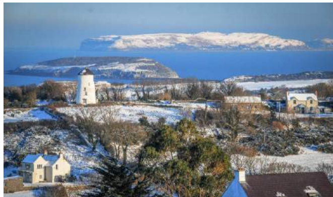
December 2010: looking from Mariandyrys, Llangoed, towards Puffin Island, with the Great Orme in the background