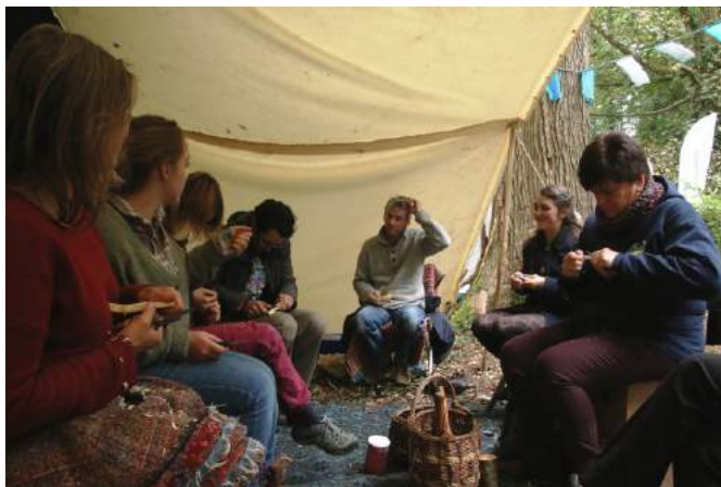
At last year's Woodland Festival, Plas Newydd, Llanfairpwll: making wooden spoons in a Cwlwm Seiriol workshop