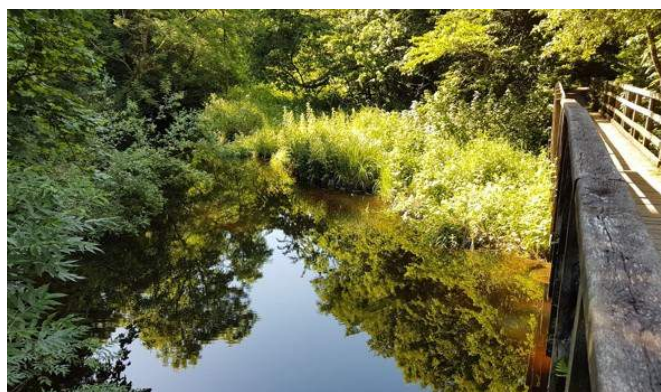
What a contrast! The Dingle, Llangefni: tranquil reflections on a summer's day

that not all of Anglesey is hilly but my part is. Did you like that: 'my' part? I cannot tell you the pleasure that writing that gave me. From our windows we can see glorious (what I think they call 'pastoral') scenery in one direction and Snowdonia and the Straits in the other direction.