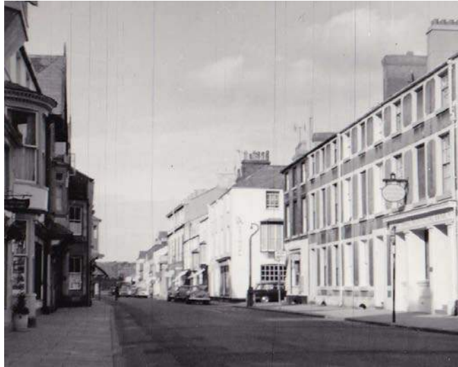
Beaumaris: Castle Street in the mid-1960s, the National Provincial Bank, Bulkeley Terrace, on the right; not many cars in sight...compare this with the top photograph on page 8 of The Puffin 24