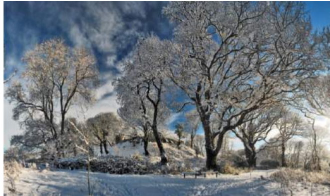
December 2010: Castell Aberlleiniog, hiding behind the trees on a small hill off the path between Llangoed and Lleinio

Here's our usual round-up of what's on in the locality. It doesn't cover everything that's on, so if you think that an event is missing and should be mentioned, do let us know, please; our contact details and submission deadlines are always given on page 8.